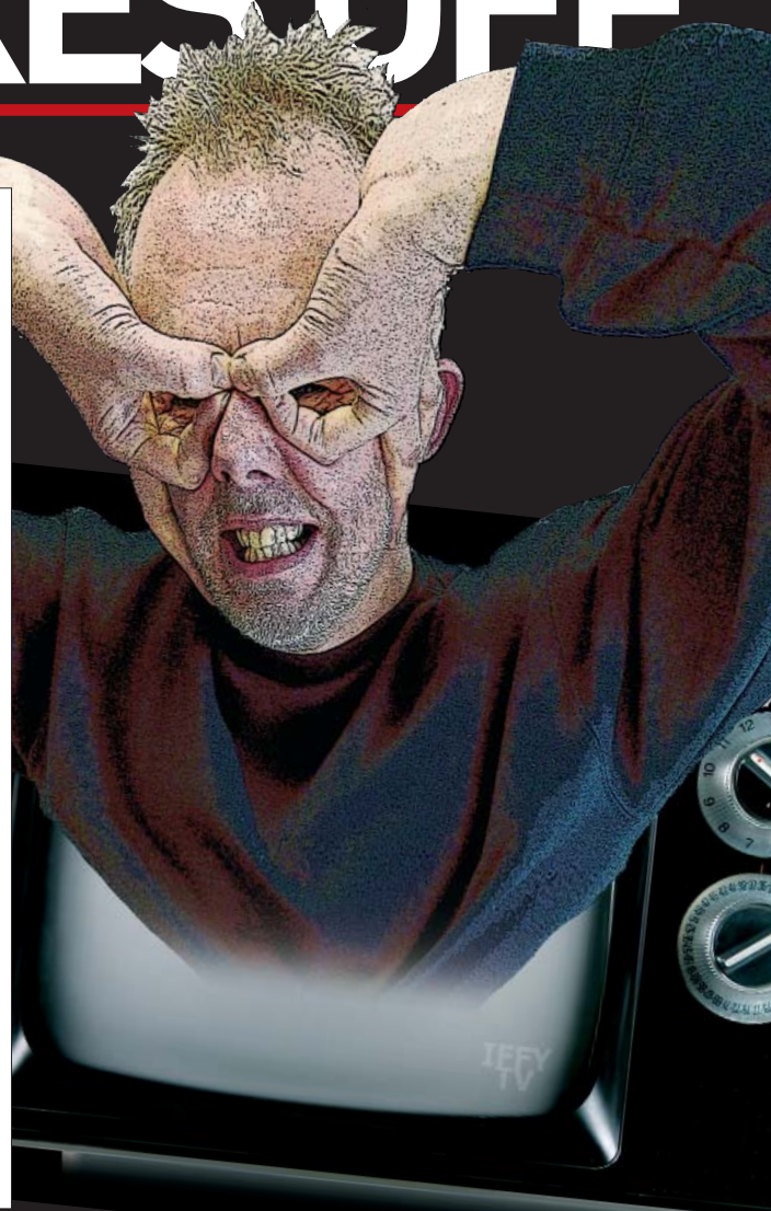
Uncle Iffy recording the 'pilot' show

TOT will use this vehicle to keep you informed about all such related nonsense and T-shirt stuff so make sure you turn on, tune in, sign up and drop out of the real world.